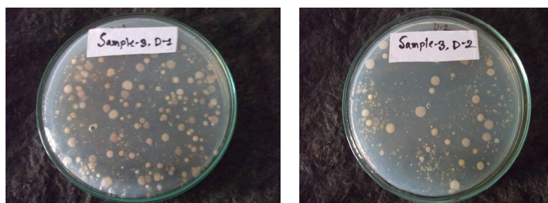
Fig. 1. Colonies of actinomycetes appeared on the dilution plates using the marine soil sample.

Among the 29 isolates, 73.53% exhibited antimicrobial activity during primary screening (Table 2). The isolate AIAH-10 showing promising broad spectrum activity against different pathogenic organisms (Figure 2) was selected for further study. The potential strain AIAH-10 was identified by morphological, cultural and biochemical study. The complete data was reported in Table 3 and 4. Findings of this study suggested that the strain was belonged to Streptomyces spp.