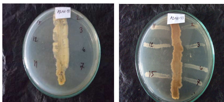
Fig. 2. Antibacterial activities of the isolates (against Streptococcus agalactiae (2), Bacillus cereus (3), Pseudomonas aeruginosa (6), Escherichia coli (7), Shigella dysenteriae (11), Shigella sonnei (12) and Agrobacterium (15)) through single line streaking technique.

Legend, The values expressed as mean ± SEM of 3-4 experiments. “-” indicates no inhibition