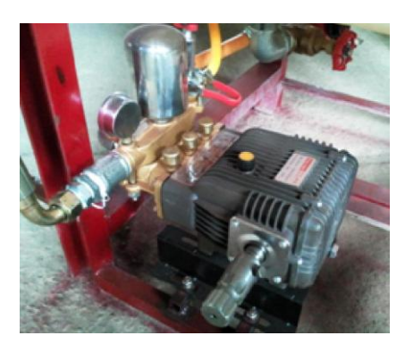
Fig. 3. Water pomp and main valves.

This circuit composed of input, output and central processing unit. First, analyzed data of aerial maps include the needed amount of flow rate in the region and also needed time for passing of tractor from that region was entered to the apparatus by a keyboard. In the system menu, 20 routes were fitted as an arable land zoning. This was done to both tested valves. Processor sector was composed of a programmable microprocessor from RAM family which its task was receiving, storage, analysis and display of data. Since this microprocessor has the latest technology of programmable processor, its processing speed is high. In order to movement of tractors in farms, it would need to the high speed order to the electrical valve, so this processor had been used. In order to show the route information e.g. passing time of tractor and position of electrical valves, a LCD display was embedded in the circuit (Figure 4).