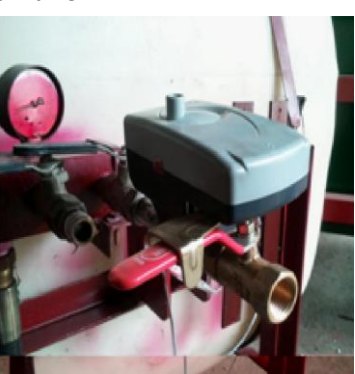
Fig. 1. First electric valve.