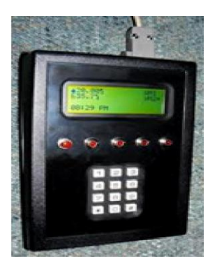
Fig. 4. The central controller of apparatus.

This circuit composed of input, output and central processing unit. First, analyzed data of aerial maps include the needed amount of flow rate in the region and also needed time for passing of tractor from that region was entered to the apparatus by a keyboard. In the system menu, 20 routes were fitted as an arable land zoning. This was done to both tested valves. Processor sector was composed of a programmable microprocessor from RAM family which its task was receiving, storage, analysis and display of data. Since this microprocessor has the latest technology of programmable processor, its processing speed is high. In order to movement of tractors in farms, it would need to the high speed order to the electrical valve, so this processor had been used. In order to show the route information e.g. passing time of tractor and position of electrical valves, a LCD display was embedded in the circuit (Figure 4).