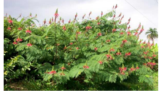
Fig. 1. C. calothyrsus shrub.

Several strategies can be used to increase digestibility, which include: Physical treatment, biological treatment and chemical treatment (Sarnkolong et al., 2010; Usha et al., 2001). Urea treatment is a chemical method that has however emerged as a treatment method of choice for use especially on farms in the tropics for smallholder farmers (Ambaye, 2009). It is preferred due to its low cost and ease of handling (Nianogo, 1999). Urea treatment can serve as a delignification process through ammonification and is also a source of nitrogen (Vadiveloo and Fadel, 2009). The effect of urea treatment on chemical composition of forage legumes has not been fully elucidated on C. calothyrsus . The tendency has been to extrapolate from known effects on maize stover. This is problematic given the differences between maize stover and leguminous forage trees. A major difference between maize stover and legumes cited by Van Soest (1994) is that whilst legumes often contain a higher content of lignin than grasses, only the xylem vascular tissues are lignified. In general, legumes tend to be higher in lignin and crude protein and lower in cell wall than tropical grasses. In grasses, lignin is distributed throughout the plant tissue (Wilson, 1993). This research therefore sought to investigate the effects of graded levels of urea treatment on nutrient composition and in-vitro digestibility of C. calothyrsus leaves.