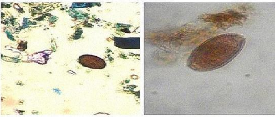
Fig. 1. Egg of Dicrocoelium sp. (x10).

a, b: The infestation rates of the same line followed at least by a different letter, significantly vary at the level of 5%. A, B: The infestation rates of the same column followed at least by a different letter, significantly vary at the level of 5%.