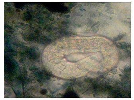
Fig. 6. Larva 1 of Strongyloides sp (x40).