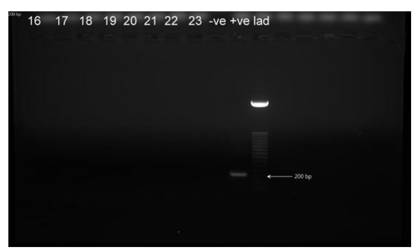
Fig. 2. Agarose gel electrophoresis of KIV nested PCR products. 16-23 indicate the samples while lad shows 50 bp DNA ladder. Lanes –ve and +ve show negative and positive controls respectively.

The exact mechanisms of MCV transmission and spread among human population have not been identified yet. The probability of MCV to be associated with prostate cancer increases if it has the ability to transmit to individuals through urinary tract, like the way that some other polyomaviruses transmit (Bluemn et al., 2009). Serological studies showed that MCV infection is almost common in human population and there are some reports indicating 80% seropositivity in adults (Chang and Moore, 2012). Several attempts to find evidences of association of MCV with other types of human tumors were unsuccessful (Giraud et al., 2008; Andres et al., 2010; Giraud et al., 2009). In a large study of 1241 tumor samples to detect MCV DNA, only 10 MCC samples were positive for MCV and other tumor samples including ovary, large bowel, uterine cervix, breast, soft tissue tumors, melanoma, and basal cell carcinoma, were negative for MCV (Dalianis and Hirsch, 2013). In another research its DNA was detected only in 1 of 54 breast cancer tissues (Antonsson et al., 2012). There are various reports about isolation of unintegrated MCV DNA from different types of tissues. These infected tissues exhibit low MCV DNA replication which suggests MCV to be in latent phase and cause a persistent infection in these tissues (Chang and Moore,