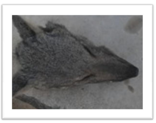
Plate I. Photograph of head of jackal (Canis aureus).

P Value 0.6809, OR 0.8116, CI (0.1538- 4.283).