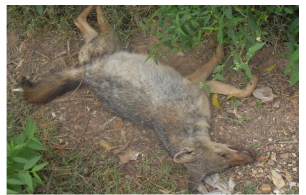
Plate II. Photograph of a jackal (Canis aureus) Killed in a farm land.

Plate I. Photograph of head of jackal (Canis aureus).