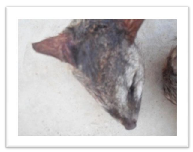
Plate III. Photograph of head of a mongoose (Mungos mungo).