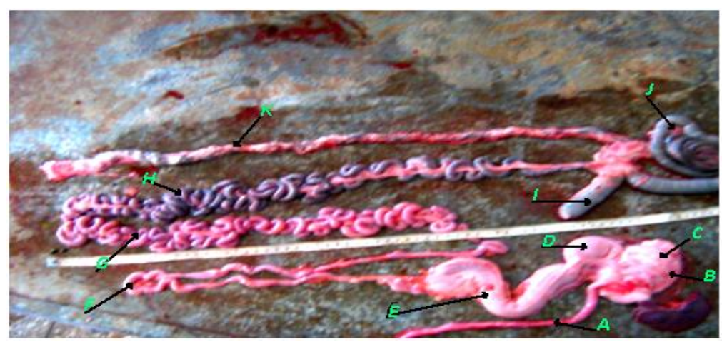
Plate 3. Photograph showing the entire digestive tract of camel fetus at third trimester showing oesophagus(A), smooth part of the rumen (B), coarse part of the rumen (C), reticulum (D), abomasum ((E), duodenum (F), jejunum (G), ileum (H), caecum (I), colon (J) and rectum (K).

The digestive tract index ranged from 37.86 at the first trimester to 13.60 at third trimester, while the digestive system index ranged from 57.14 at the first trimester to 27.20 in third trimester fetus as shown in Table I. The weight of the camel fetus at all three phases of gestation (first, second and third trimesters) were observed to increase as the fetus advanced in age (Table 1).