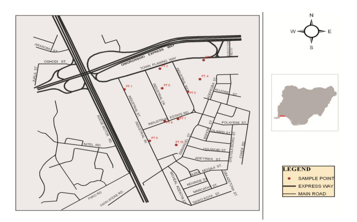
Fig. 1. GIS Base - Map of Ilupeju Industrial Area Showing Spatial Distribution of Sampling Sites.