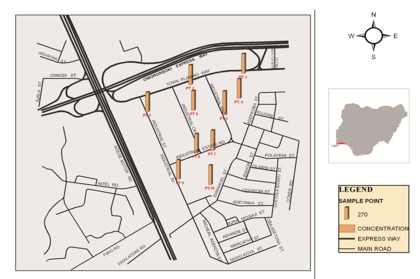
Fig. 3. GIS Base-Map of Ilupeju Industrial Area Showing Spatial Distribution of Total VOCs.